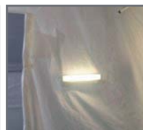
ROFI Cabin light