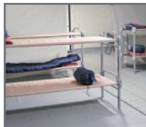
ROFI Disco bed