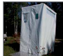
ROFI Toilet/Shower tent