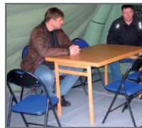
ROFI Folding chair/table