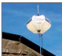
ROFI Camp light