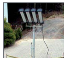
ROFI Camp light