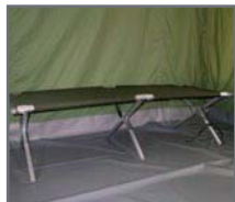
ROFI Field bed