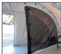
Mosquito separation wall